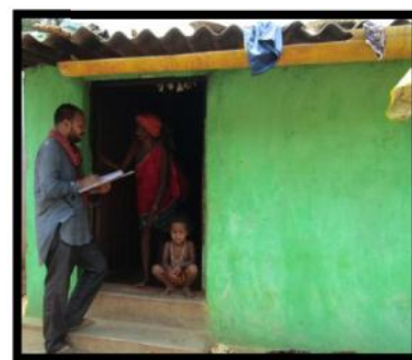
Table 3- Beneficiaries interviewed during the Social Audit

Verification with Individual Beneficiaries: it was decided to personally verify 20% of ICDS beneficiary of all categories i.e. 6 months to 6 years of children, pregnant and lactating women and MAMATA beneficiaries. Respondent were selected as every fifth beneficiary from the beneficiary list. Also with the same respondent if she was TPDS beneficiary, PDS format was filled. SPREAD had prepared a standard verification format for each scheme.