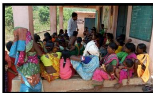
Table-2, FGD and Village meeting details

Focus Group Discussion: Focus Group Discussion was held with beneficiaries of ICDS, MAMATA and PDS in all the sample villages. In tag villages of AWCs and distant hamlets from AWCs, separate FGDs were conducted. Participants of the FGD were women who are either pregnant or lactating or whose children (6 month to 6 years) registered in the sample AWCs. FGD was conducted based on pre formulated lead questions to gather opinion of group about functioning of services and schemes related NFSA- 13. Growth Monitoring Chart, Mid Upper Arm Circumference (MUAC) tape and Mother Child Protection cards (MCP) were used to share information with participants and further they were asked to share their opinion regarding growth monitoring services and health services like immunization, health check up, Ante Natal Care (ANC) etc. Total 9 FGDs where 230 women from focus group were present. Responses of FGD were recorded as minutes of meeting and signature of all participants were taken. At the end of FGD, responses of group was shared with participants and theirs accent was taken. Further these responses were analysed on separate indicators and recorded in the format.